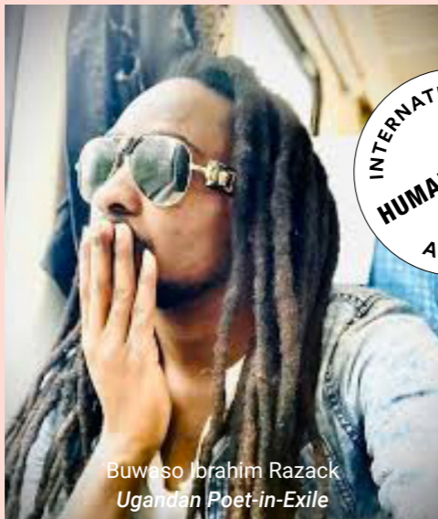
Buwaso Ibrahim Razack Ugandan Poet-in-Exile