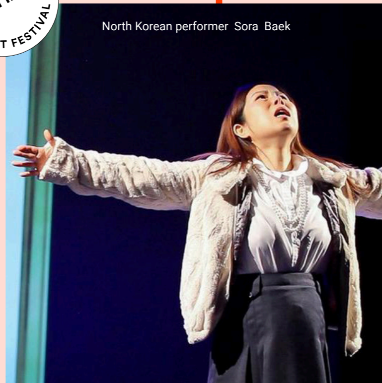
North Korean performer Sora Baek