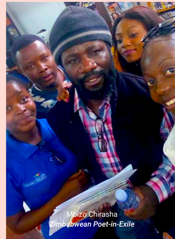
Mbizo Chirasha Zimbabwean Poet-in-Exile