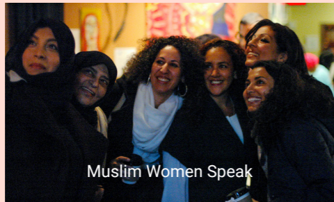
Muslim Women Speak