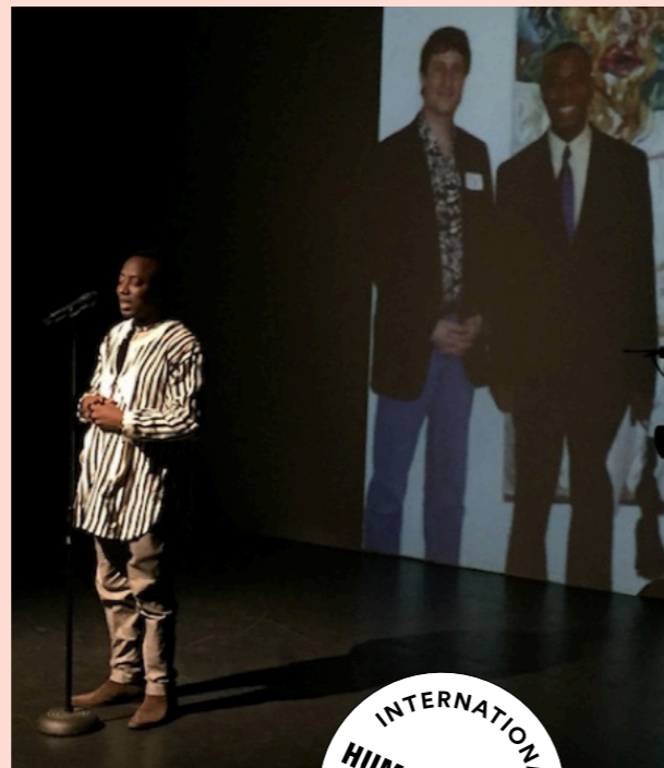
Sowore Omoyele speaking at the IHRAF

Our new Direct Action program provided monetary support, transparency for safety and general awareness of the Direct Action recipients' plight. We highlighted artists and activists whose freedom of expression is threatened. Our commitment to these Direct Action recipients remains as long as they are at risk.